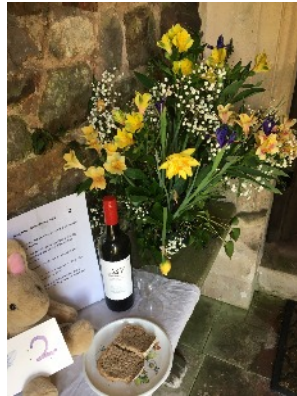
Templeton - The Last Supper