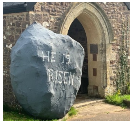
Templeton Church Easter Sunday!

Do come and visit. The church will be open daily from 9.30 a.m. to 5.00 p.m.