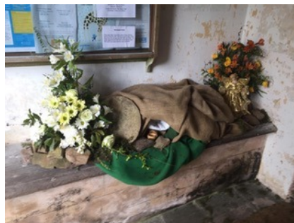
Cruwys Morchard - The Empty Tomb