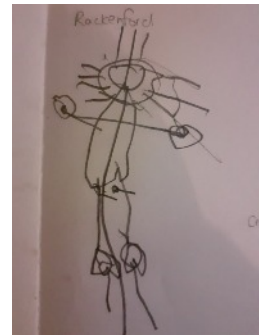
Tilly's interpretation of the Easter Flower Trail at Rackenford The Crucifixion

On the first Wednesday each month we meet in person. Check out Steph's weekly update or the website.