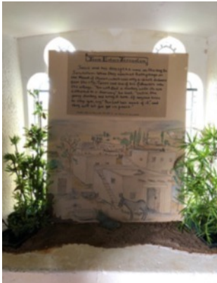
Palm Sunday - Washfied