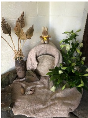
Oakford - The Burial