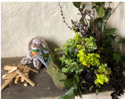
Loxbeare - Peter's Denial