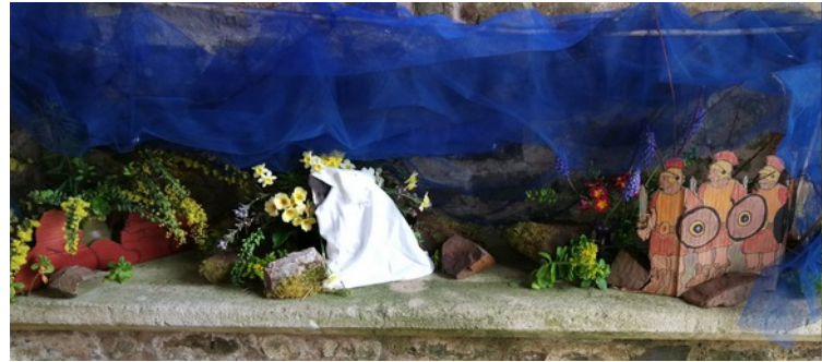
Withleigh - The Garden of Gethsemane