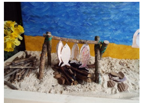
Calverleigh - Picnic on the Beach