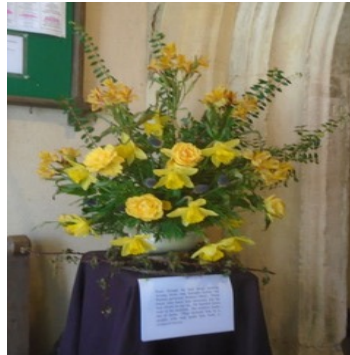
Stoodleigh - The Trial