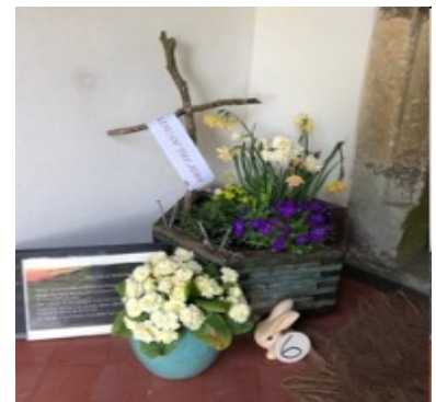
Rackenford - The Crucifixion